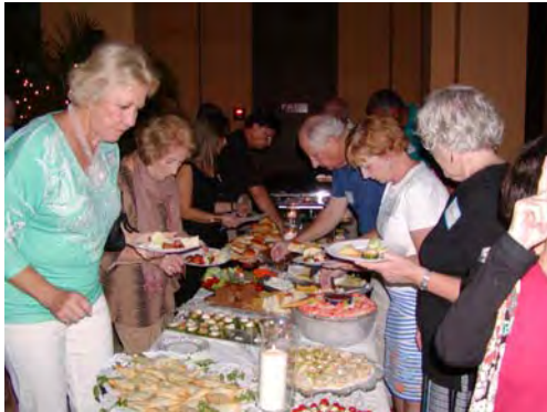
Great buffet at the cocktail party

The Renaissance Social Committee Team has been serving an increasing number of residents in its social events this year. The season started with a “Back to School” Tuesday night social, a Lido Beach Sunset dinner, and a bus tour to Cape Coral for Oktoberfest.